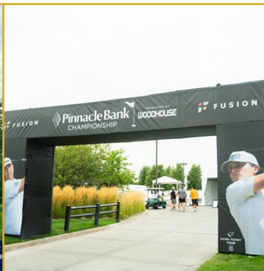
Main Entrance Sponsor